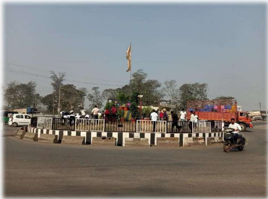
STUDENTS MAINTAINING POTS ON CIRCLE OUTSIDE THE COLLEGE