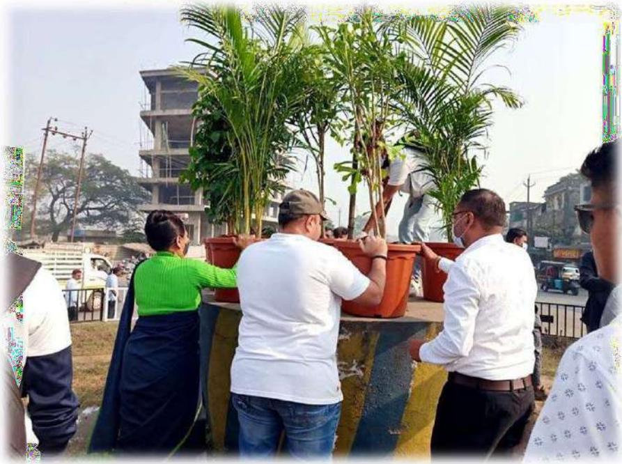
STUDENTS JOINING THE INITIATIVE OF GREEN EARTH