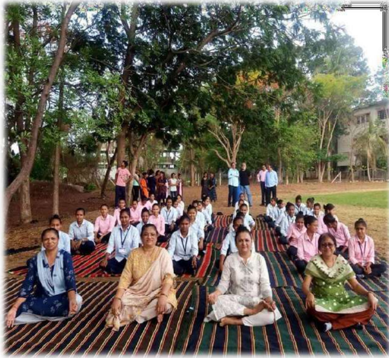
LUSH GREEN GROUND