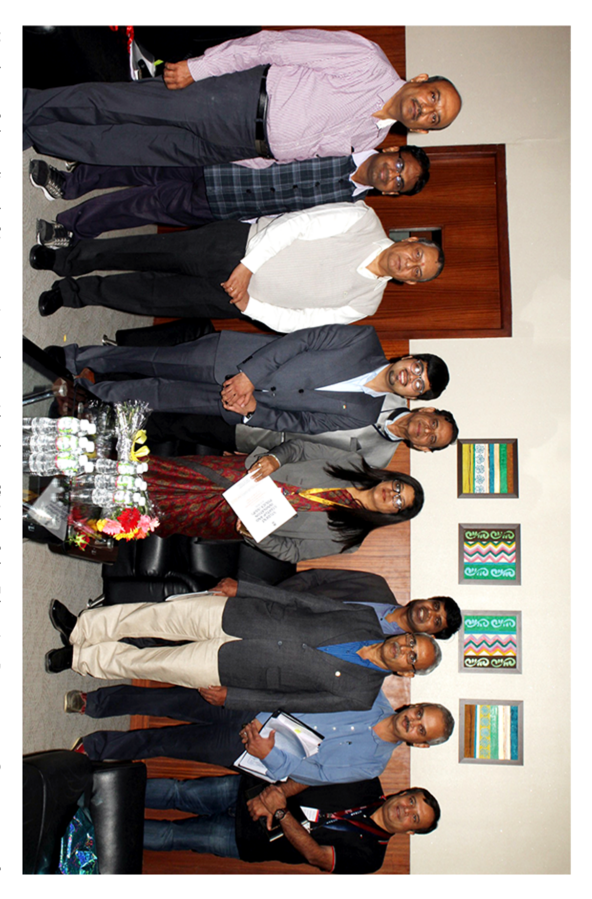
Policy Gujarat, at Mahatma Mandir on January 8, 2017, following the unveiling of the Student Startup and Innovation Members of the policy drafting committee along with other officials of the Education Department, Government of