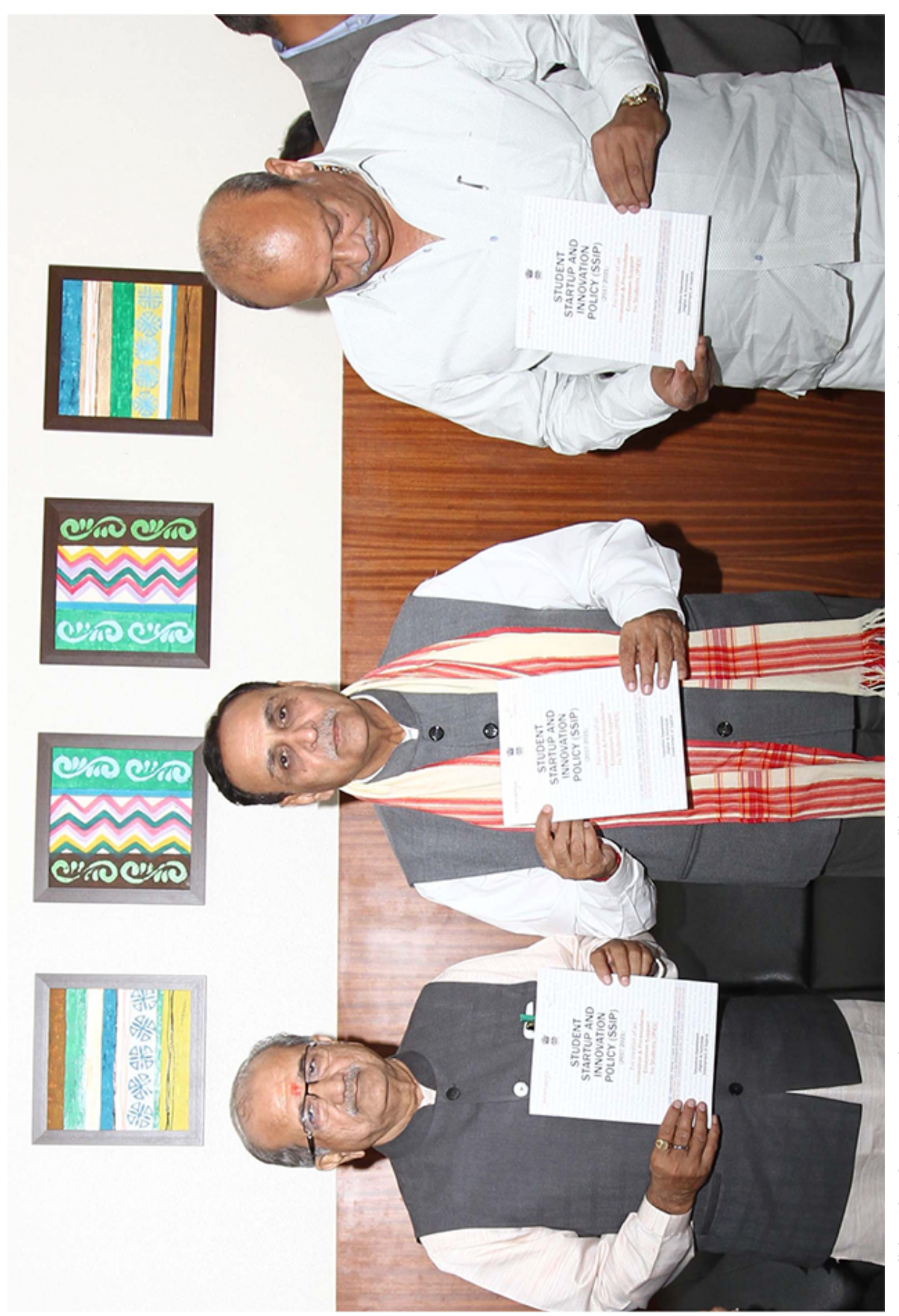
Hon'ble Chief Minister, Shri Vijay Rupani, Hon'ble Minster of Education, Shri Bhupendrasinh Chudasama, and Hon'ble Minister of State for Education, Shri Jaydrathsinh Parmar, unveiling the Student Startup and Innovation Policy at Mahatma Mandir, Gandhinagar, on January 8, 2017.